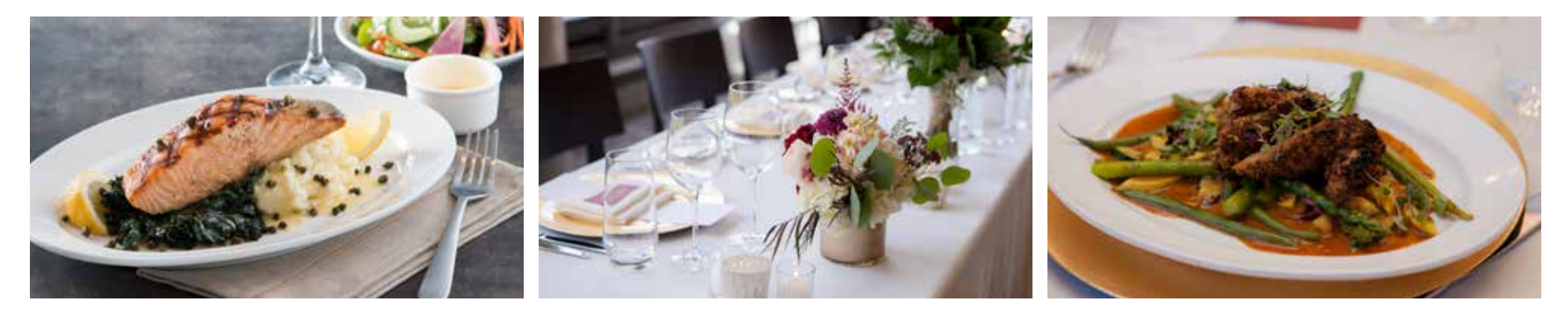
Prices do not include the 21% service charge and applicable sales tax. Prices and menus are subject to change. January 2022

VEGETARIAN ASSIETTE 💇 🖉 Beluga Lentil Cake, Roasted Trumpet Royale Mushrooms, Seasonal Vegetables